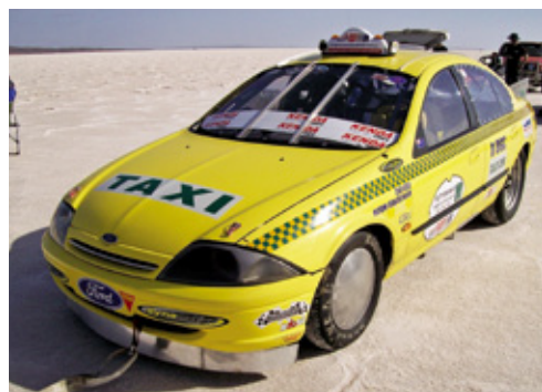
Norm Bradshaw is the current DLRA president. At the last meeting, Norm's taxi went into a spin at 205mph. Since then, Norm and his team have been removing salt from every part of the car including the inside of the turbo, where the salt was baked solid and had to be machined out! Norm says "the car is ready to go" and is looking forward to the big event.

Spectators are welcome so if salt lake racing is something on your bucket list, or you and your mates just need to have a big adventure, this event will be the one not to miss! Our race team, Big Knob racing usually drives to Port Augusta where we stay overnight. We get our last supplies next morning and head to Iron Knob. At Iron Knob we take a right turn and drive 131 kms on dirt, corrugated road, across creek crossings while trying to avoid kangaroos, emus, sheep and feral goats. The guys at Mount Ive station give us access to the lake via their property they also run the canteen and camping area. The canteen usually provides good meals but I always bring extra food and lots of water. Remember