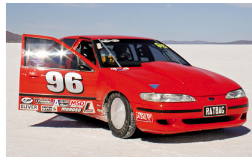
Daryl Charmers is hoping for big speeds at Speedweek 25. Daryl has added more weight to the car and more compression to the Ford Windsor. His aim is to go faster than the current class record that stands at Bonneville. The Falcon needs to beat 225mph. Good luck mate.