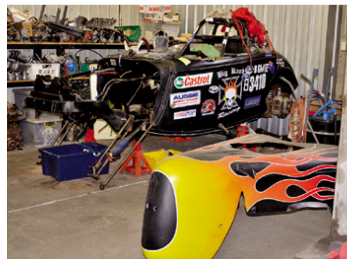
Big Knob Racing's roadster is at Engine Action in Echuca, Victoria, where engine builder and fellow racer Matt Lagoon is giving the big block Ford a freshen up. I am proud to say the tough little roadster holds two Australian land speed records over 200mph. We intend to make that four records over 200mph at Speedweek 25.